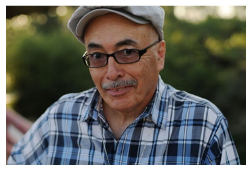
Juan Felipe Herrera

When we think of literacy, we often think of the isolated acts of reading or writing. While reading and writing are an essential part of literacy, these terms alone don't communicate the social and cultural nature of literacy. It's important to remember that literacy always involves the act of communicating a message for a specific purpose and takes place within a specific sociocultural context. In other words, literacy involves more than the rote reading or writing of symbols and printed text. It encompasses all the cultural nuances and meaning of oral language that lie behind the written word—words which are arranged and communicated in a specific manner depending on their audience and intended purpose (e.g., grocery lists, market signs, short poems). Remember that DLLs will be learning the early literacy practices and associated conventions of two or more languages and cultures—all within a variety of social contexts!